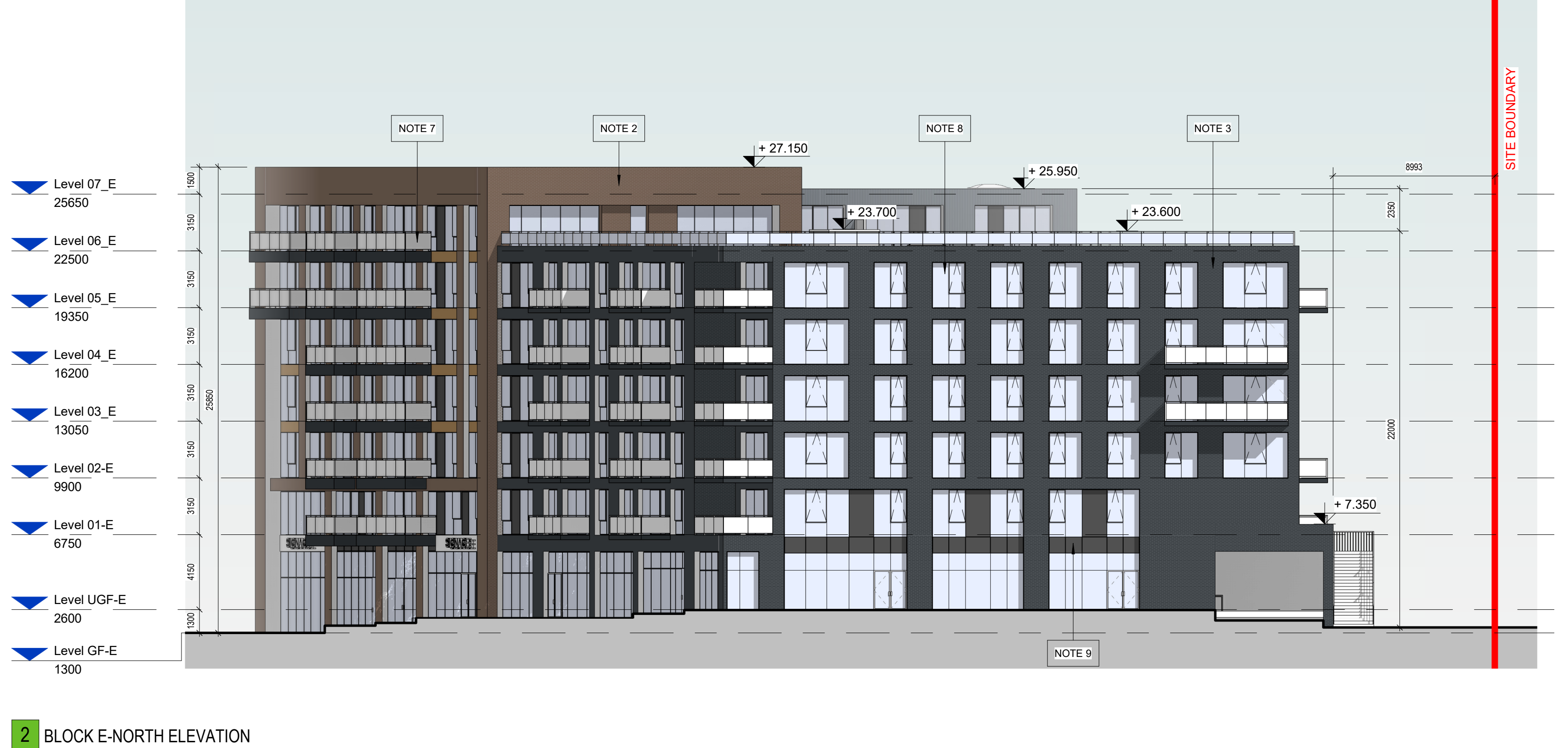
1 : 200

THE COPYRIGHT OF THIS DRAWING IS VESTED WITH CW O'BRIEN ARCHITECTS LIMITED AND MUST NOT BE COPIED OR REPRODUCED WITHOUT THE CONSENT OF THE COMPANY.